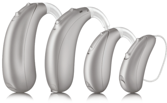
Unitron Ativo UP Unitron Ativo SP Unitron Ativo M Unitron Ativo RIC